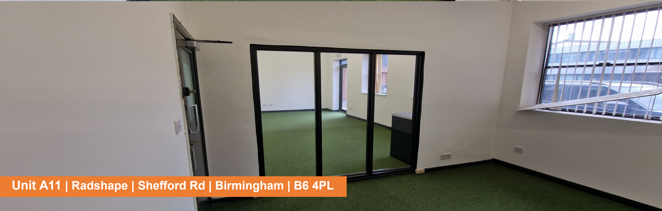
Unit A11 | Radshape | Shefford Rd | Birmingham | B6 4PL