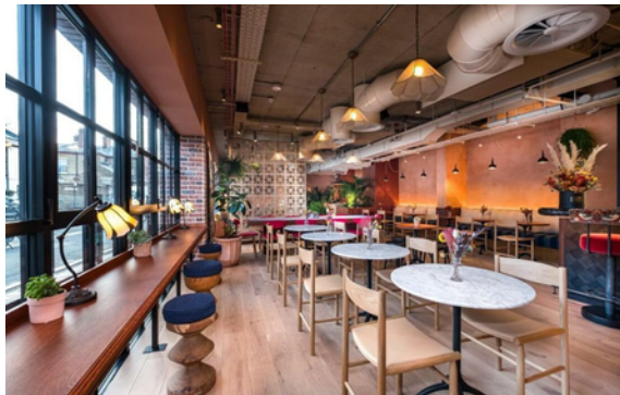
Room2 Chiswick Homestay

Airivo Chiswick is moments from the vibrant Chiswick High Road – where premium dining, boutique shopping, and essential amenities are all just steps away.