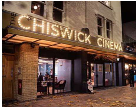
The Chiswick Cinema