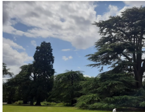
Boston Manor Park