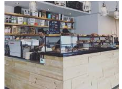
No 6 Coffee Shop