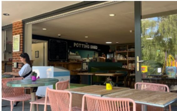
The Potting Shed