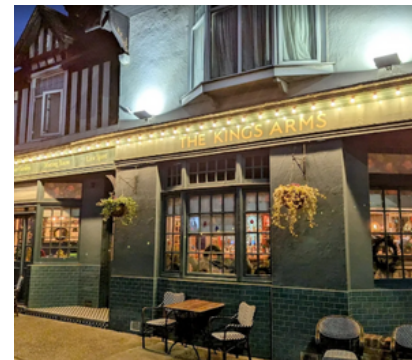
The Kings Arms