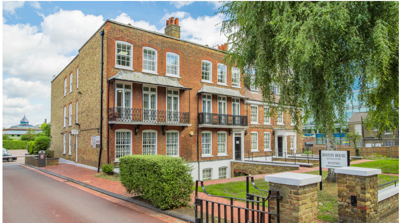
On Site Parking The building boasts a generous allocation of car park bays

Our Brentford offices are conveniently located near the riverside, cafés, shops, and green spaces, including Boston Manor Park and Syon Park. This balance of urban convenience and natural beauty enhances the working day for teams and visiting clients alike.