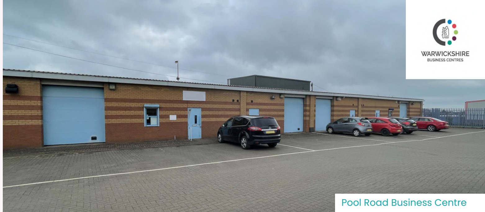
Pool Road Business Centre

Warwickshire County Council's Business Centres are purpose-built to support the growth of small and medium-sized enterprises (SMEs) across the county.