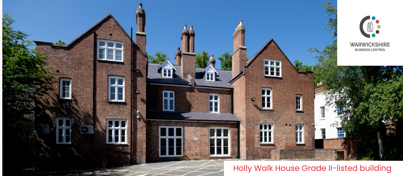
Holly Walk House Grade II-listed building

Warwickshire County Council's Business Centres are purpose-built to support the growth of small and medium-sized enterprises (SMEs) across the county.