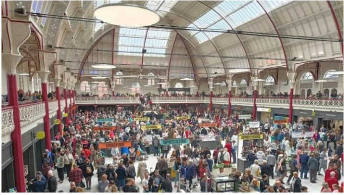
Derby Market Hall – re-opening day (May 2025) following a £35m refurbishment programme

Contact: Trevor Raybould Telephone: 01332 295555 Email: trevor@raybouldandsons.co.uk