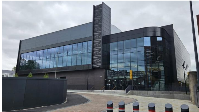
Vaillant Live – Derby's new 3,500 capacity performance venue