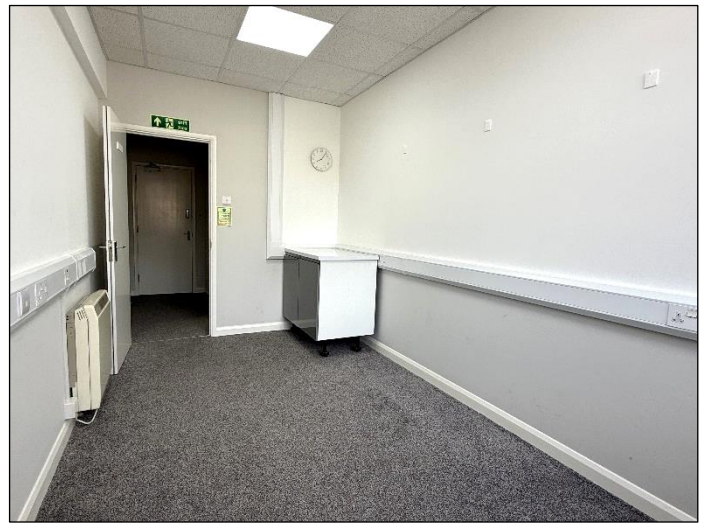
Library Photos of other Offices at Bridge House. Full details on request