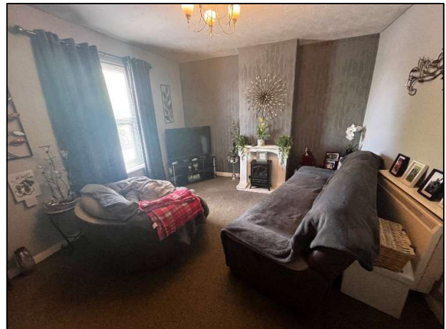
(First Floor Flat Living Area)

Externally there is a W/C which is included with the ground floor retail unit demise and 1 car parking space.