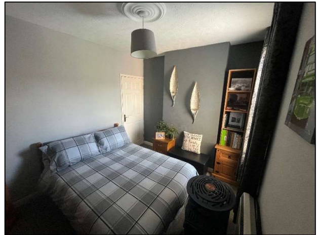
(First Floor Flat Bedroom)

The ground floor retail unit benefits from vinyl floors, painted plaster walls, suspended ceilings, fluorescent lighting and UPVC double glazing. The basement is of a more basic specification.