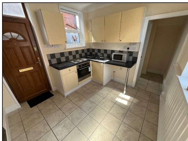
(Ground Floor Studio Flat Kitchen)

According to the Valuation Office Agency 412 Osmaston Road has a rateable value of £3,350. 412a and 412b are in council tax band A.