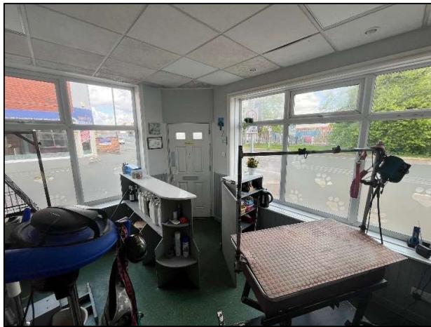
(Ground Floor Retail Sales)

There is a self-contained one-bedroom flat to the first floor being accessed from the rear which has a bedroom, lounge, kitchen and bathroom.