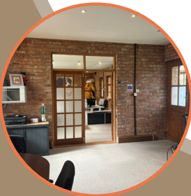
Filled with natural light