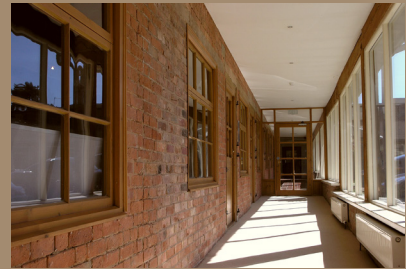
The courtyard corridor with lots of natural light