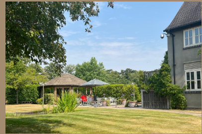
The garden room, overlooking one of the many water features we have in the landscaped gardens.