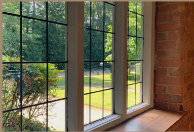
Nature on view from every window