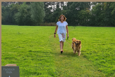
Dog friendly environment