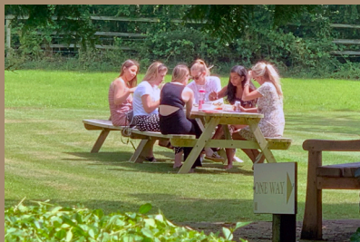
Plenty of space to relax and think...