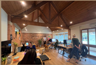
A little look into one of our 23 Offices...

Just minutes from Melton Mowbray and the A47, our 10,000 sq.ft. complex of luxury courtyard offices accompanied by a wealth of on site amenities can make a real difference to the way you and your team work and think.