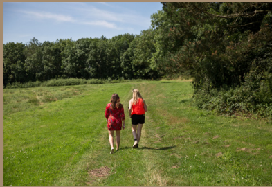
Take your meeting outdoors on one of our three walking routes