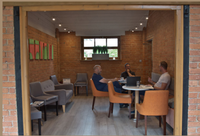
A total of 7 Internal & External breakout areas throughout the park