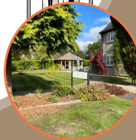
Beautifully landscaped gardens