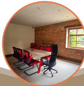
A bright and modern office space