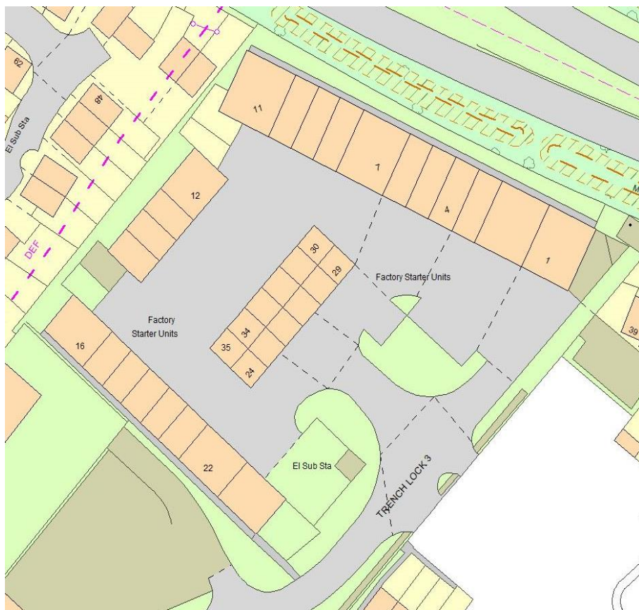
Plans for Illustrative Purposes Only: