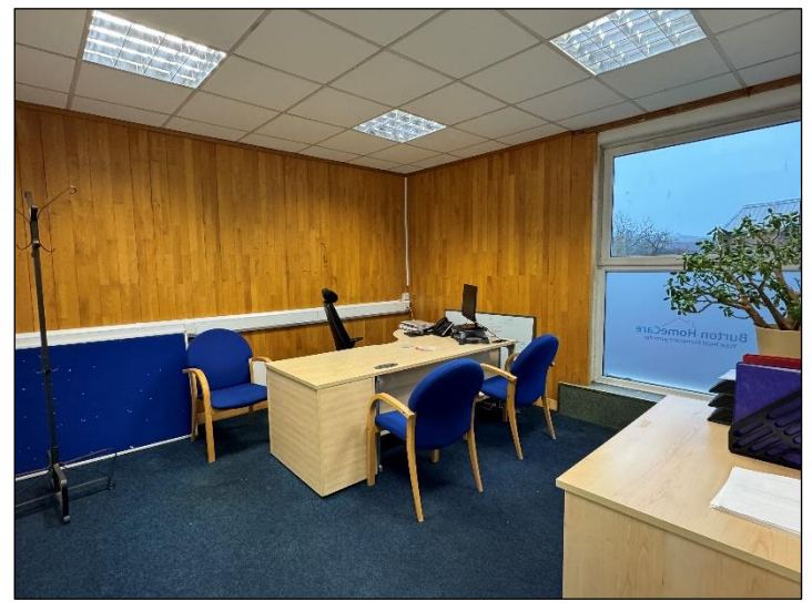
Store Room 2.76m x 2.21m (9'1" x 7'3") max Useful room ideal for storage or for IT server / Photocopier.