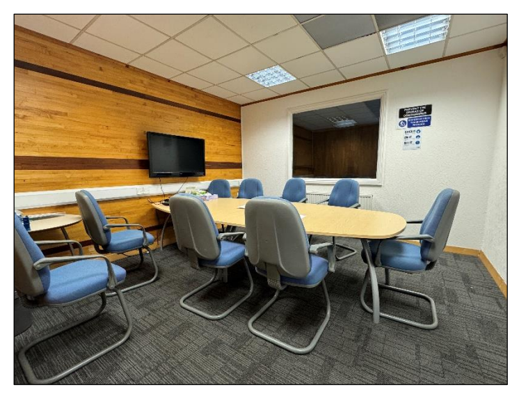
Office 4 3.96m x 3.92m (12'11" x 12'10") max Window to the front with strip lighting and power points as fitted. Radiator.

Office 3/ Meeting Room 4.00m x 3.93m (13'1" x 12'10") max Strip lighting and power points as fitted. Translucent roof panels providing borrowed light. Radiator. Window to front office.