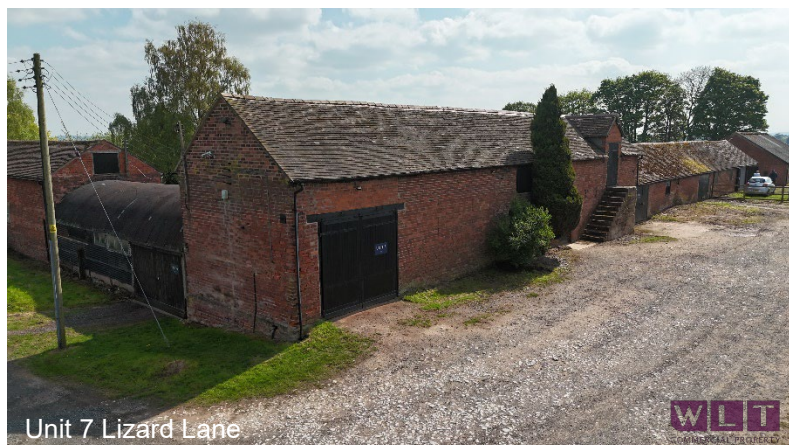
Unit 7 Lizard Lane