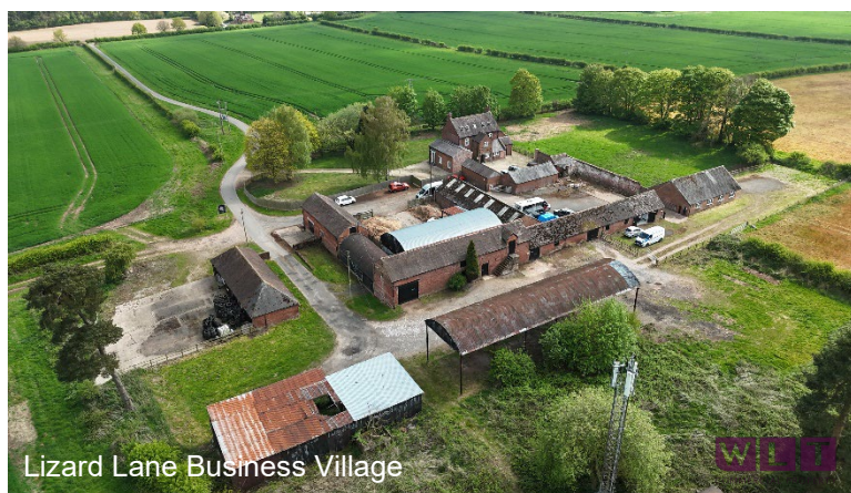
Lizard Lane Business Village

Lizard Lane Business Village is conveniently situated close to the A41, approximately 6.6 miles east of Telford Town Centre, 12.1 miles north of Wolverhampton City Centre, and 2.9 miles north of Junction 3 of the M54.