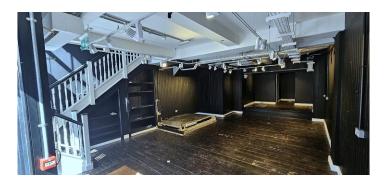
Ground Floor sales Area

Gross Internal area 1,860 sq ft (172 .8 sq m)