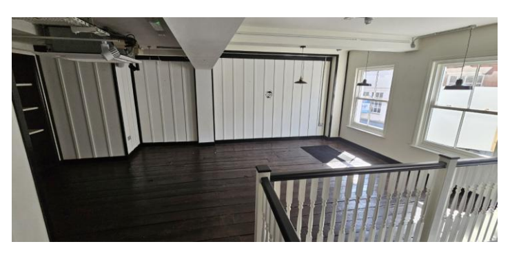
First Floor sales Area

Tel: 01332 295555 / 07855 550538 Email: martin@raybouldandsons.co.uk