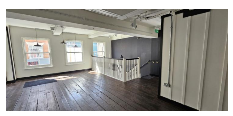
First Floor sales Area