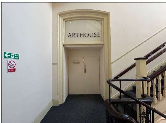
Main Entrance from First Floor

The area is characterised by a number of period buildings, many dating from the Georgian/Victorian era which are now converted for use as professional offices, bars and shops.