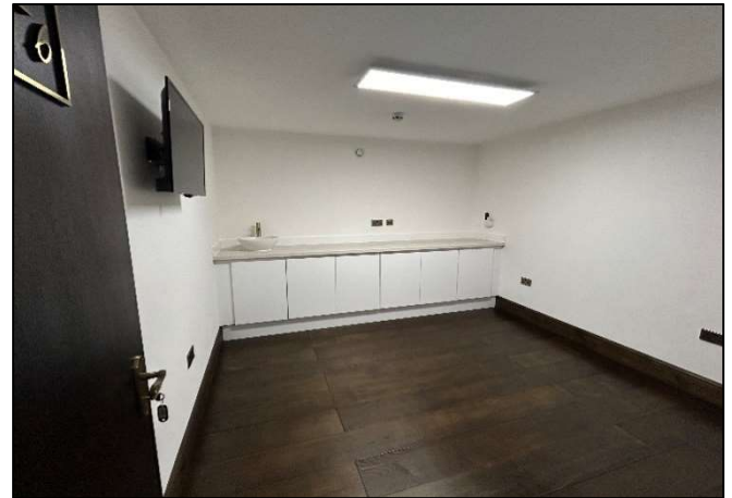
High quality treatment room

access to seven suites and two individual offices. The complex has exclusive use of male and female WC facilities at ground floor level.