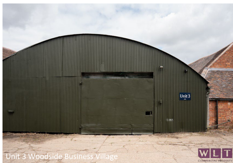
Unit 3 Woodside Business Village

Woodside Business Village is conveniently situated just off the A41, approximately 6.6 miles east of Telford Town Centre, 12.1 miles north of Wolverhampton City Centre, and 2.9 miles north of Junction 3 of the M54.