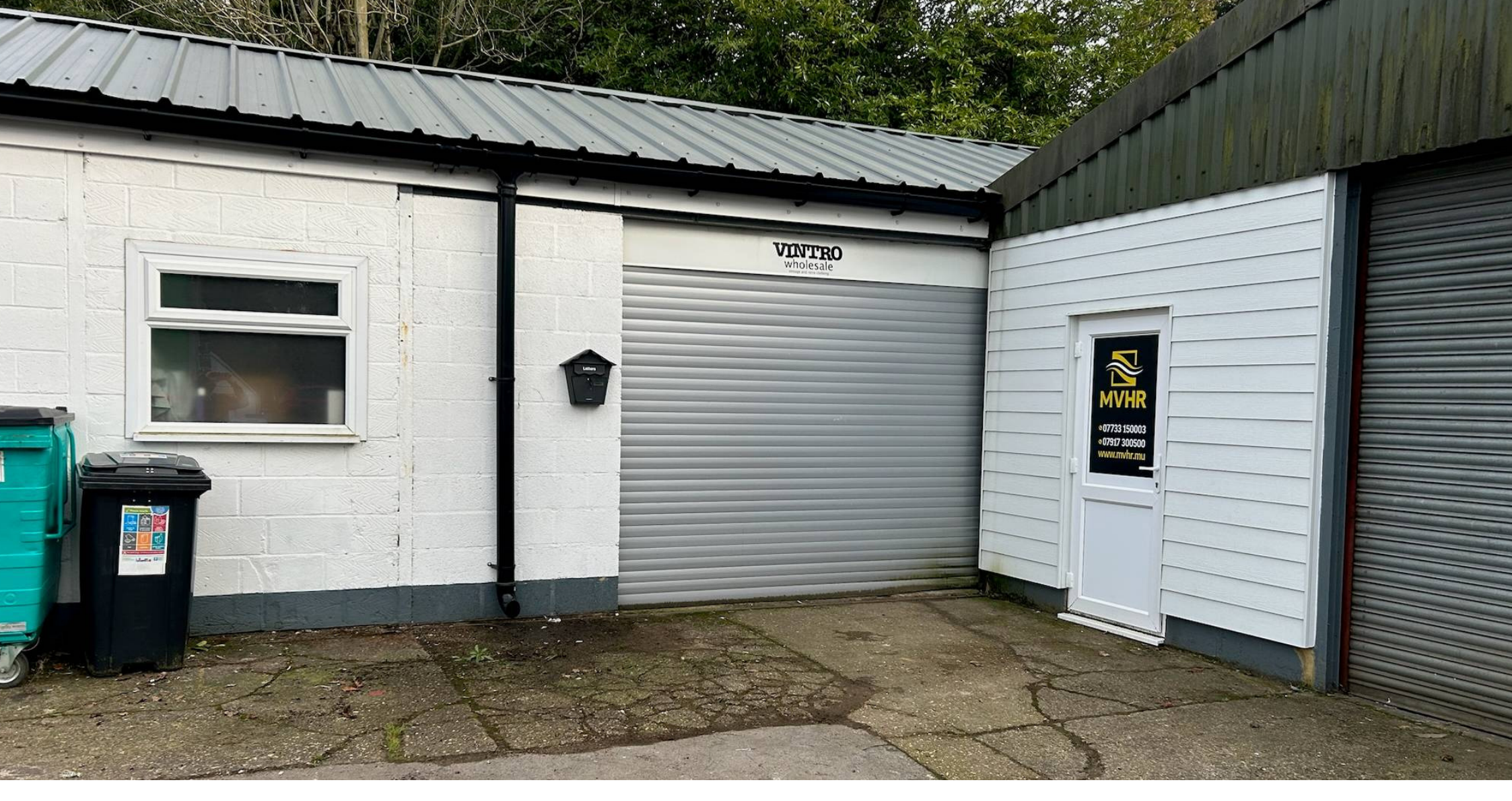
UNIT 3, SENDALLS YARD, CRAWLEY ROAD, ROFFEY, HORSHAM, WEST SUSSEX, RH12 4HG