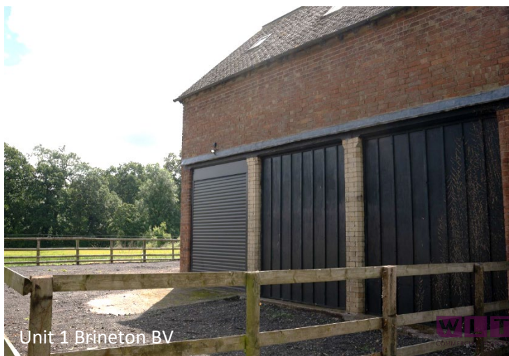
Unit 1 Brineton BV

The premises are located in Brineton, close to the A5, approximately 9.7 miles east of Telford Town Centre, 13 miles north of Wolverhampton City Centre, and 6.4 miles north of Junction 3 on the M54.