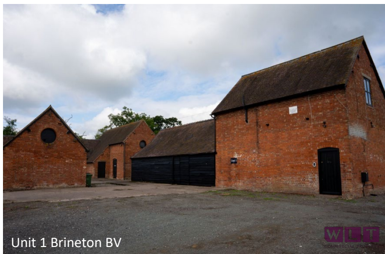
Unit 1 Brineton BV