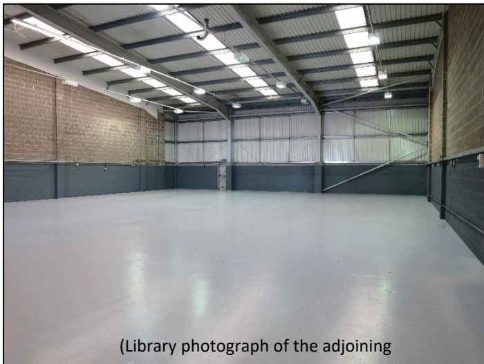
(Library photograph of the adjoining

Up and over entrance door from courtyard area offering good vehicular access to the warehouse. Glazed door with glazed side panel. Translucent roof panels. Minimum eaves 5.3m (17'3") with a maximum in the centre of 6.92m (22'8")