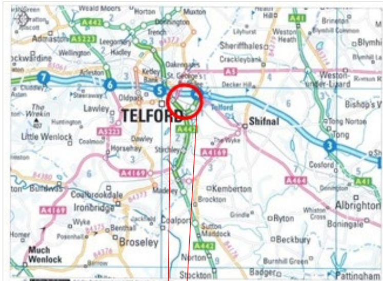
This map was created with Promap