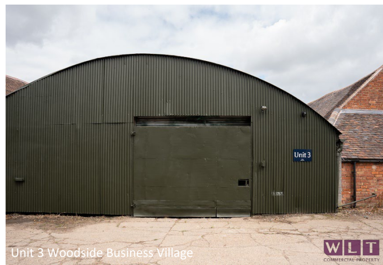
Unit 3 Woodside Business Village