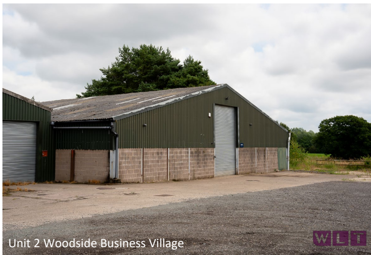
Unit 2 Woodside Business Village