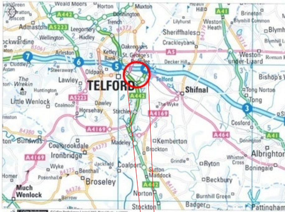
This map was created with Promap