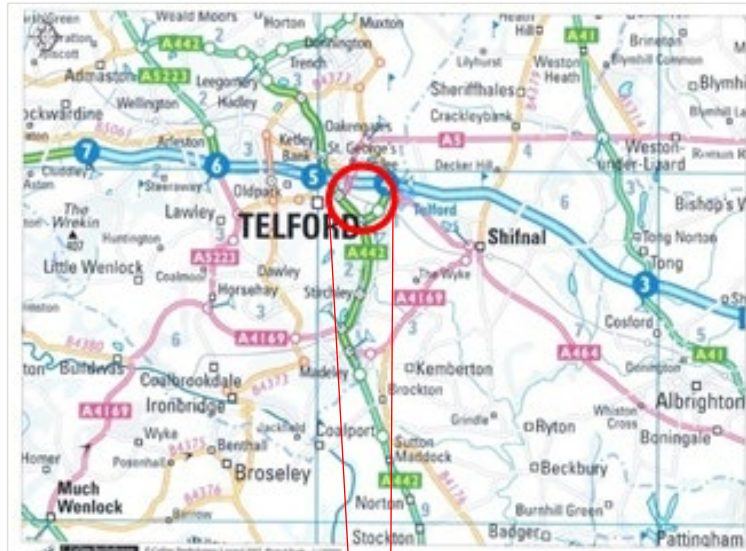
This map was created with Promap