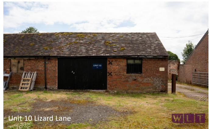
Unit 10 Lizard Lane