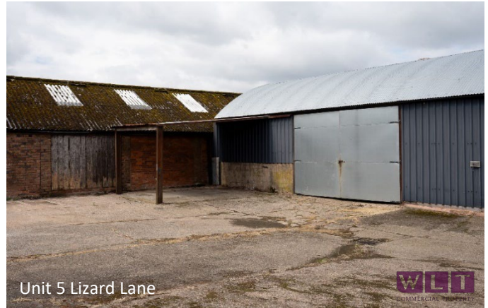
Unit 5 Lizard Lane