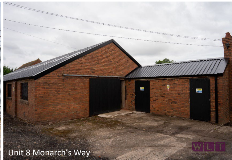
Unit 8 Monarch's Way