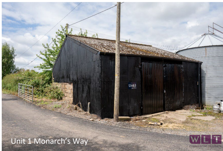
Unit 1 Monarch's Way