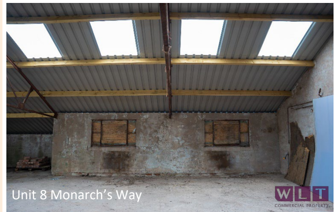
Unit 8 Monarch's Way