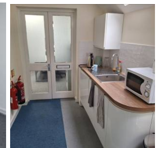
Shared kitchen area

Colyer Commercial has not checked and do not take any responsibility for any of the services within this property and would recommend that any ongoing occupier satisfies themselves in this regard. These particulars and the descriptions and measurements contained herein do not form part of any contract and whilst every effort has been made to ensure accuracy, this cannot be guaranteed. All figures quoted are exclusive of VAT if applicable.