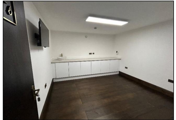
High quality treatment room

access to seven suites and two individual offices. The complex has exclusive use of male and female WC facilities at ground floor level.