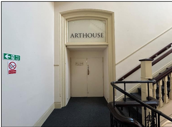
Main Entrance from First Floor

The area is characterised by a number of period buildings, many dating from the Georgian/Victorian era which are now converted for use as professional offices, bars and shops.