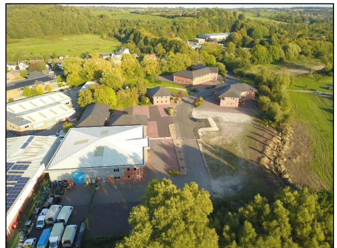
(Outrams Wharf Business Park)

Externally the property is located in a modern business park and provides dedicated car parking spaces; and a brick-paved fenced yard with external spot lighting.