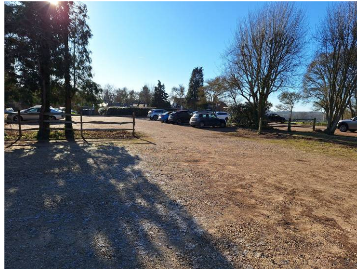
Large shared car park

Each party to be responsible for their own legal costs.