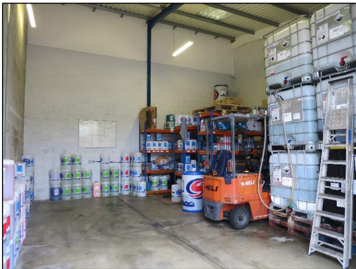
Library Photo from previous letting

Workshop 7.86m x 7.58m (25'9" x 24'10") max Accessed via either a full height roller shutter door providing good vehicular access (3.93m high x 2.98m wide) or a pedestrian door directly off of the car park area. Strip lighting and power as fitted. Concrete floor. Translucent roof panel.