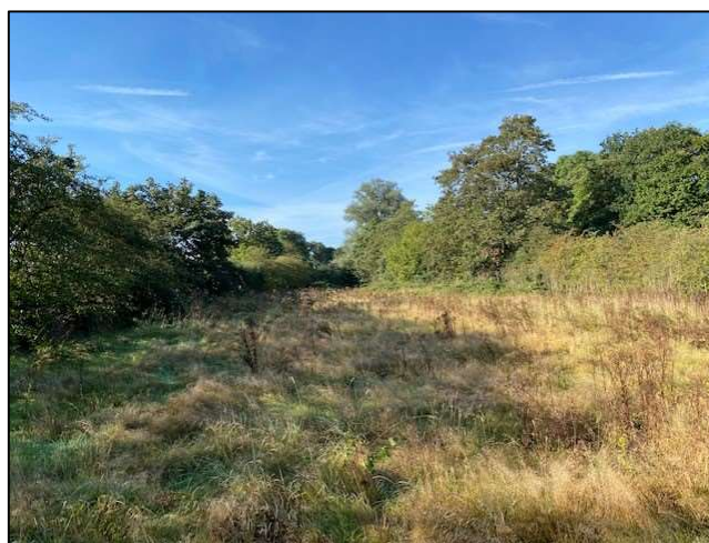
(Remainder of site)

The remainder of the site totals an approximately 1.88 acres which has the potential to be repurposed or redeveloped (Subject to planning).