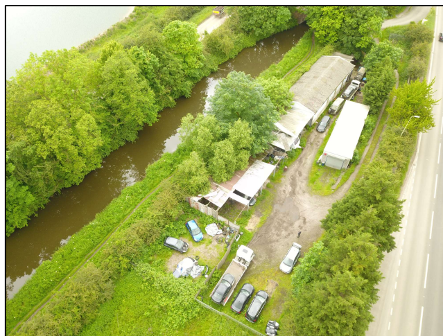
(Existing unit on the site)

electricity is able to be connected to the site. Please note we have not tested any services to the site.