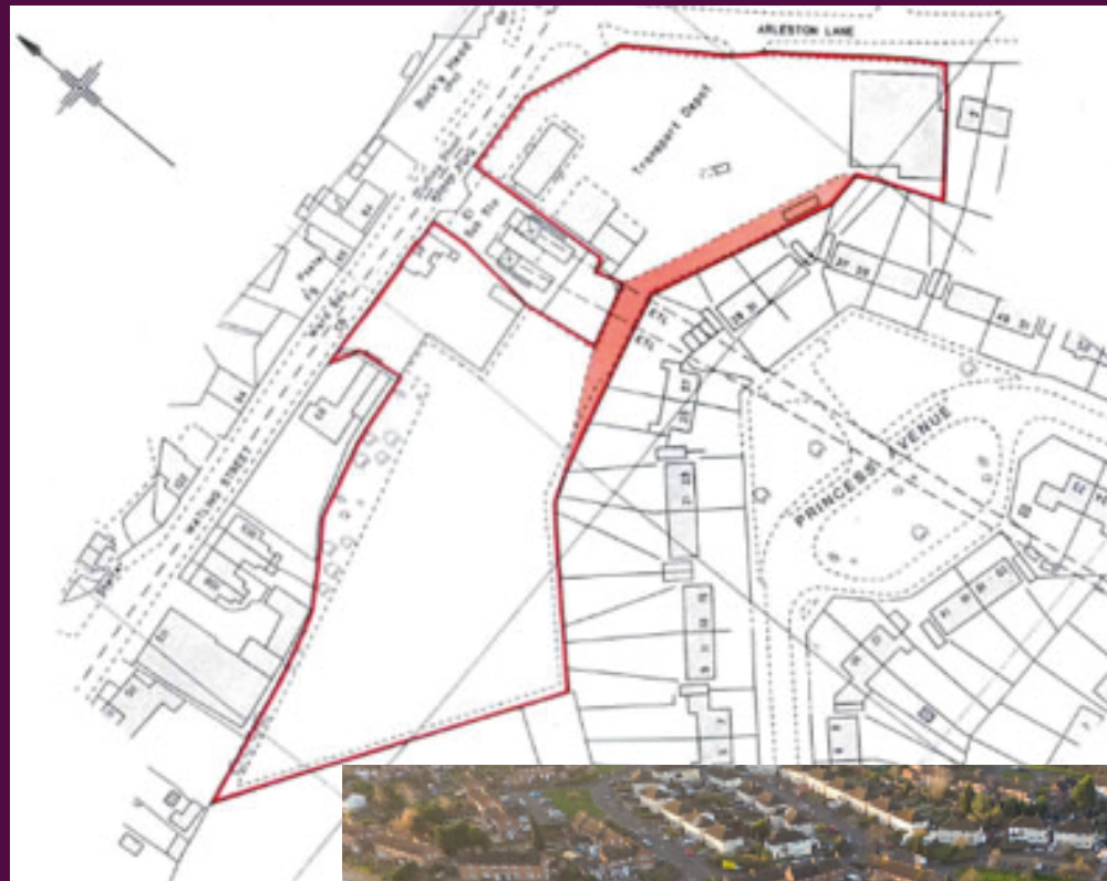
Title No: SL83153 Approximate Boundary