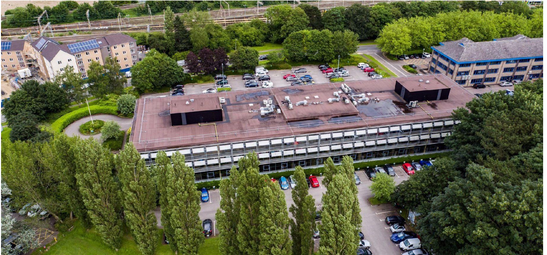
Challenge House is located next to the green and pleasant surroundings of Bletchley Park.

Challenge House is very accessible by road and public transport and there are plenty of amenities nearby.